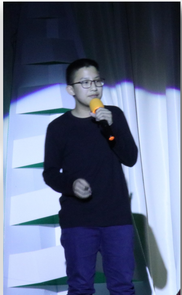
Focus, Grade 7