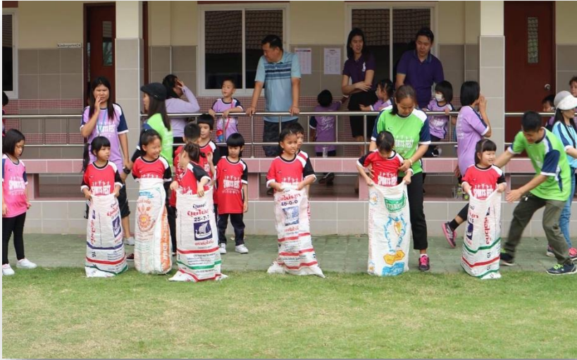
The red team is ready for the sack race.

The Kindergarten Village had their separate sports day at their building. The kindergarten sport day games were Chair Ball, Sack Race, Track and Field, Tug of War, and Long Jump. The parents came and cheered for their children as well as played for them. For the results, 3 rd runner up was the purple team, 2 nd runner up was the Red team, 1 st runner up was the pink team, and the Champions were the Blue team.