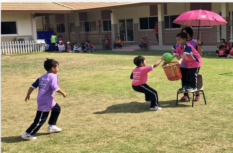
A friendly chair ball match between the pink and purple team.