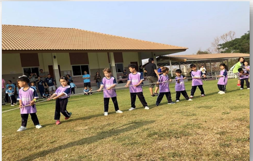
The purple team is getting ready to pull with all their might.