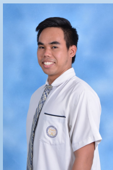
LM (Grade 12)