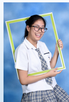
Naan (Grade 10)