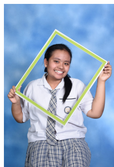
Fluke (Grade 11)