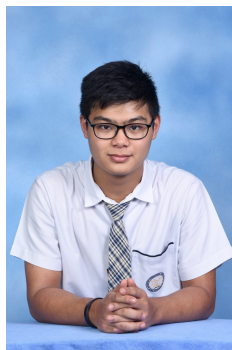
EQ (Grade 10)