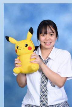
June (Grade 12)