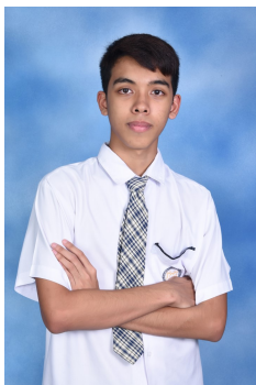
Fiat (Grade 10)