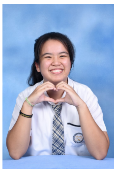
Please (Grade 10)