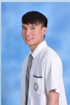
Fluke (Grade 12)