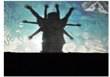
2011- "Gift of Christmas"