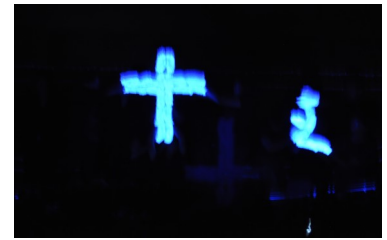
2012- "Bring Back the Glory"