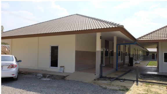
The side entrance of the building