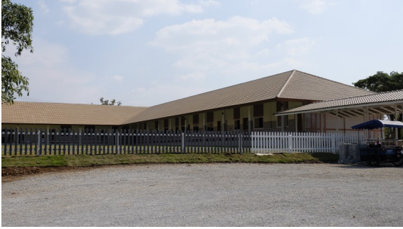
The entrance near the parking lots