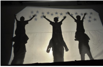
2010- "Star of Ages"