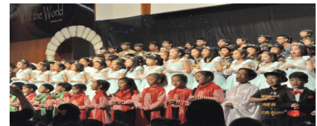
2015- "A Joyful Christmas"