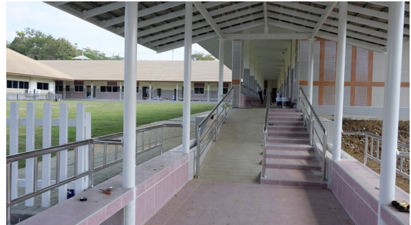
The way into the building