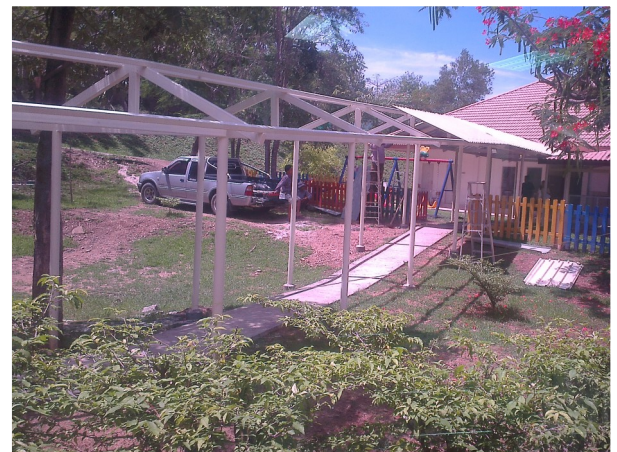
Covered Pathway from KG Village - Tarun Tudu (10)