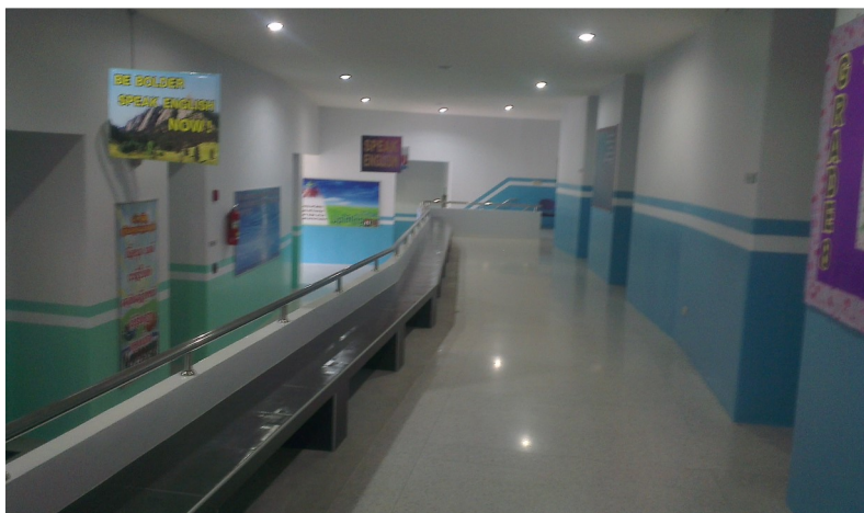
New Hallway colors