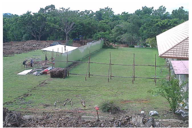
NEW Kindergarten Building (Phase 1) On-going