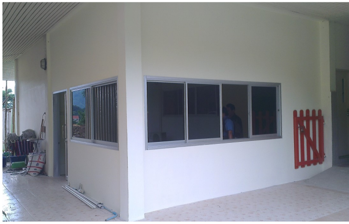
New Office for Teachers