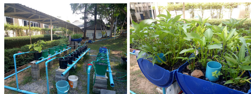
Organic vegetable garden developed by the Aquaponics Club

The Aquaponics Club was developed by teacher Clan following the suggestion of Ms. Foster. The Aquaponics Club allows you to learn how to grow organic vegetables. Aquaponics utilizes the waste of fish as fertilizer and a water system that waters the plants continuously without the need of worrying to water the plants. This system is an eye-opener for the students and the faculty alike.