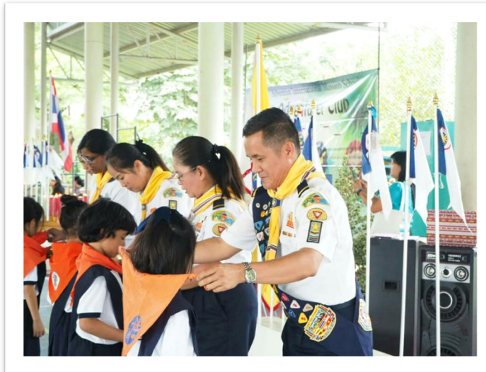
Teachers inducting Adventurers

The AIMS Adventurer club, started its Induction Ceremony on September 13, 2019. It took place in the AIMS basketball court, to accept the new students into the Adventurer club and to welcome back the old students.