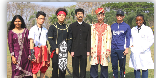
Grade 12 Students - Event Organizers