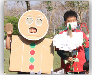
Gingerbread Man and Jack in the Beanstalk

They also believe that the next batch of students who will oversee the activities must focus on preparation. Think of more outside-of-the-box ideas and activities. Proper dissemination of information ahead of time will give the participants plenty of time to prepare for the different events that they will have to be a part of. Some activities could even be announced in the first quarter of the school year.