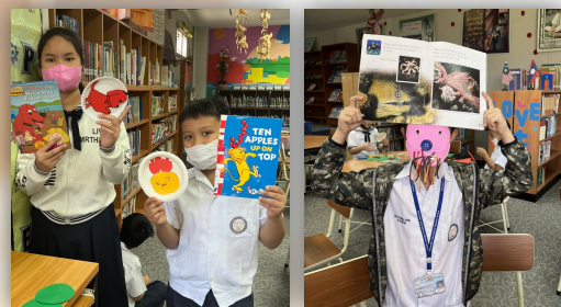
Books inspired artworks