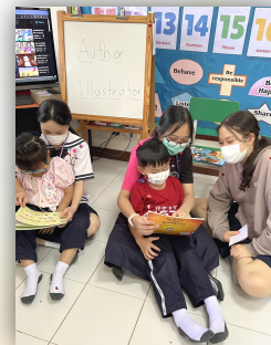
Grade six kids reading for the kindergartners.

The middle school and high school students visit the lower grades, bringing books with them to read to their reading buddies. The younger ones enjoyed listening to the animated reading of stories by the older kids. This was done under the supervision of the Language Arts teachers in their Reading