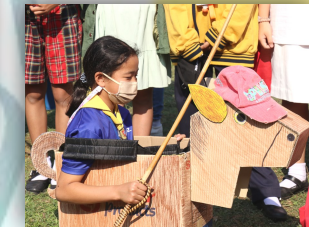
Knight on a Horse

Language Arts teachers, with the English Month organizers, is essential in making sure that the program will be educational and filled with lots of fun.