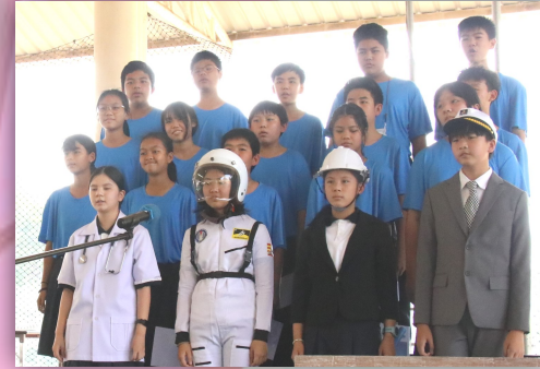
Grade 6 students in their speech choir.

Writing poems, essays, and short stories, for instance, encourages critical thinking as students had to think of the best ways to write, based on the topics or themes given to them on the day of the competition itself. Students had the opportunity to think critically while considering other viewpoints and perspectives as they were writing.