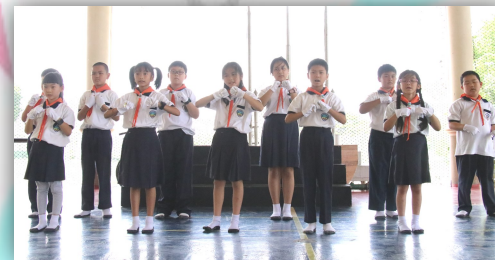
Grade 2 students doing a song interpretation

The activities helped students improve their articulation, pronunciation, gestures, and the way they speak, through activities like the speech choir and song interpretation. The poster and bookmark-making contest enabled the students to display their artistic ability and creativity. These activities were specifically planned to increase students' awareness of the English language through the demonstration of their literary abilities.